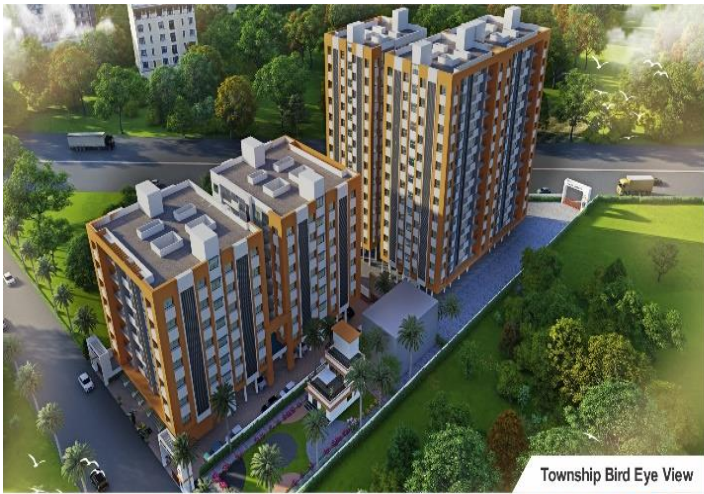
Township Bird Eye View