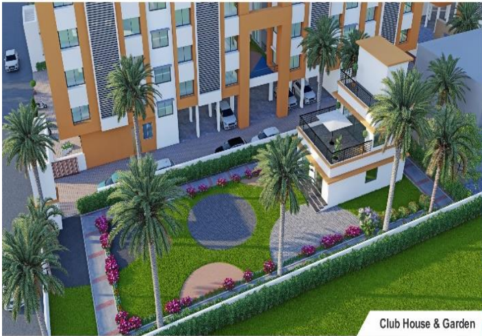
Club House & Garden